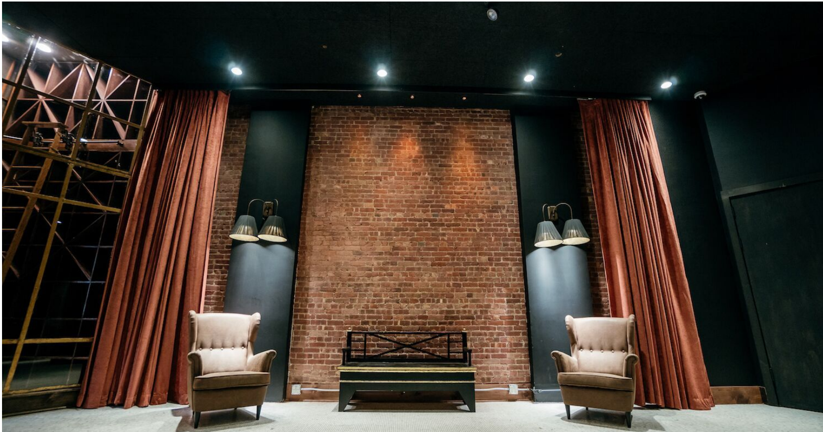
The Lounge at Town Stages | Austin Donahue